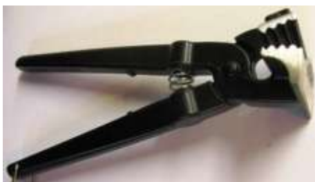
LUKAS Canvas Pliers, Black £29.00 Milled chuck jaws, 65mm wide