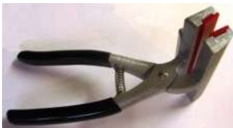
Holbein Canvas Pliers no.5 £38.00 Wide-jawed, non-slip