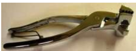
LUKAS Canvas Pliers, economy £8.15 Cast iron, 60mm jaw